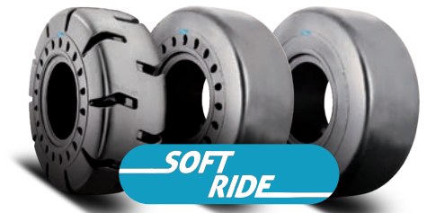
HPS Solidflex Traction