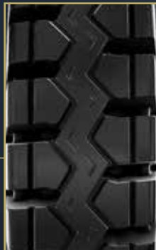
PATENTED PATTERN DESIGN

2 Lateral block design with very deep lugs to provide optimum traction in outdoor applications